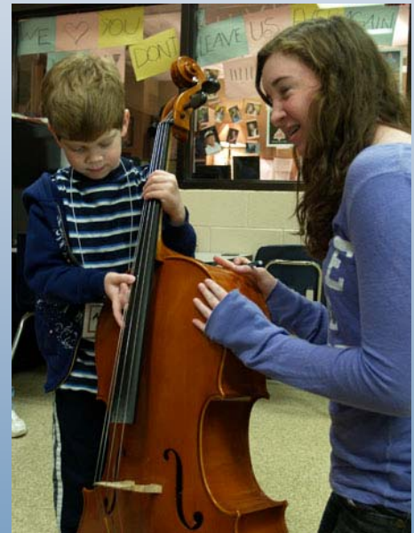
The Sounds of Music