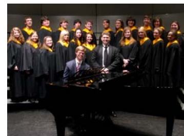
OMEA District XIII Honor Choir.