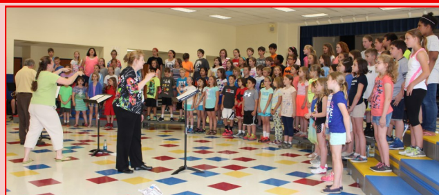
Pictured is the Chorus rehearsing for this week's performance.