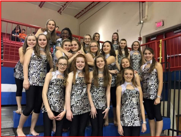
KJH Winter Guard

Congratulations to our Junior High and High School Winter Guards who placed first and second, respectively, last weekend at their show at Connor High School. This weekend, the team travels to Campbell County High School for another show. GOOD LUCK!