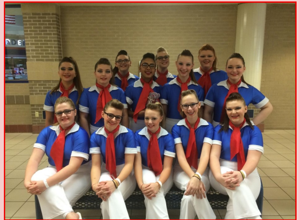
KHS Winter Guard