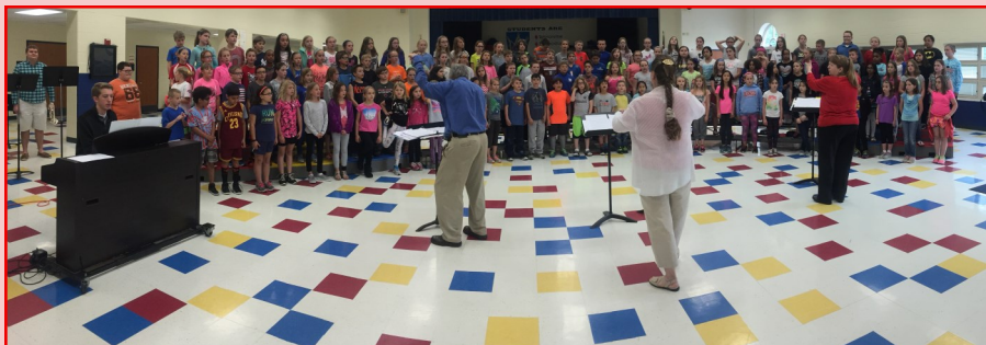
Pictured is the Chorus rehearsing for this week's performance.